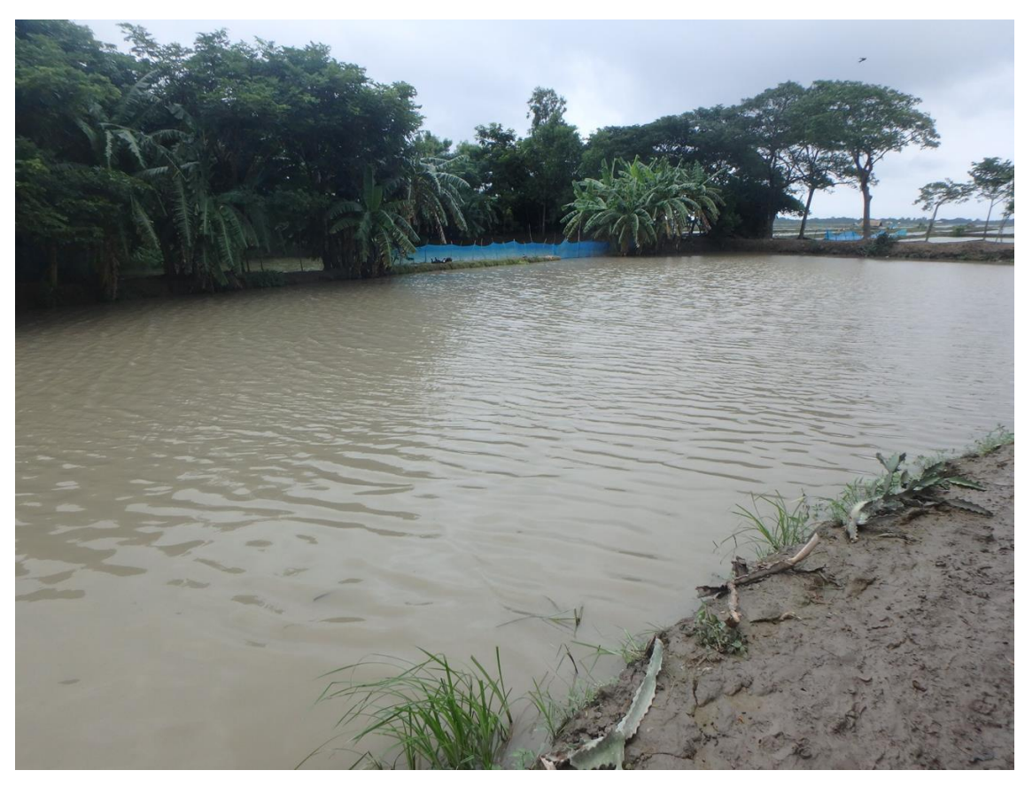
Figure 2. Drinking water pond (left) and PSF (right)