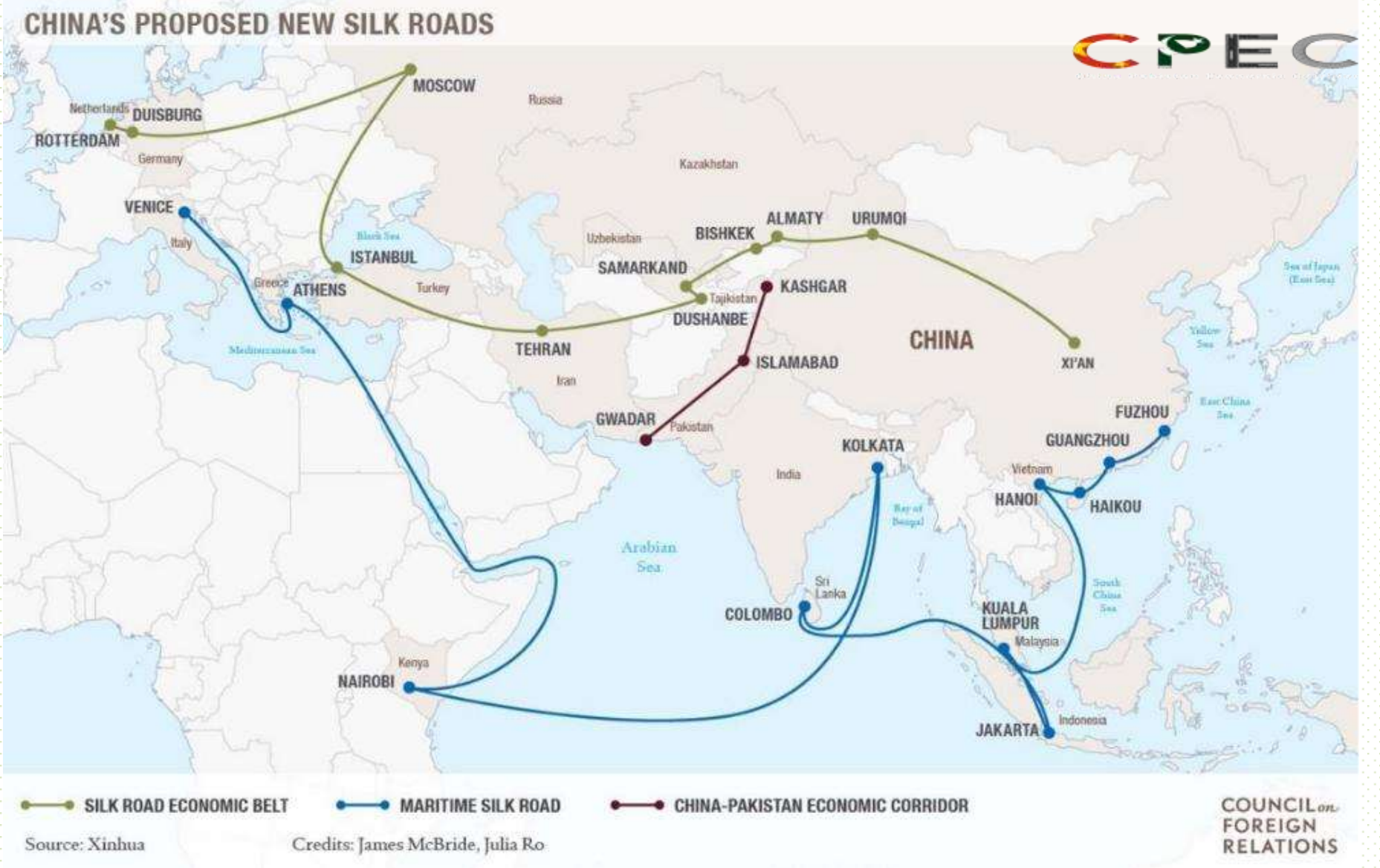
Figure. 1 CPEC in the framework of OBOR.